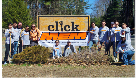
MEM Service Day

MANAGEMENT & ENGINEERING FOR MANUFACTURING