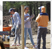
MEM Service Day